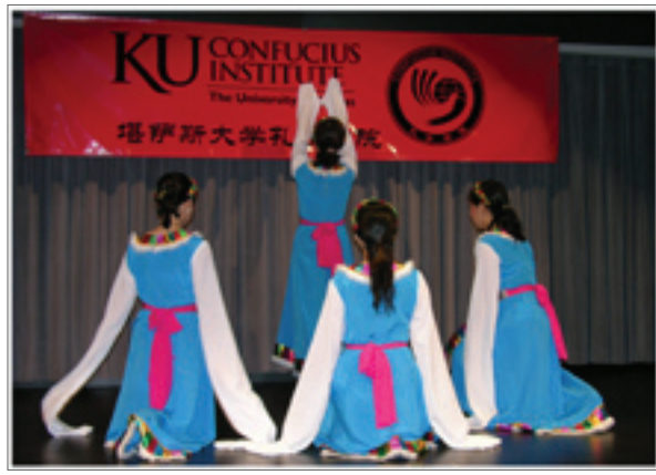
Members of the KCCNA Dancing Group strike a worshipful pose during their performance on Saturday night.