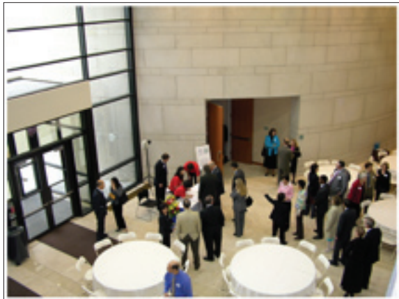
Aerial shot of early morning arrivals for the opening ceremony at Regnier Hall on KU's Edwards Campus.