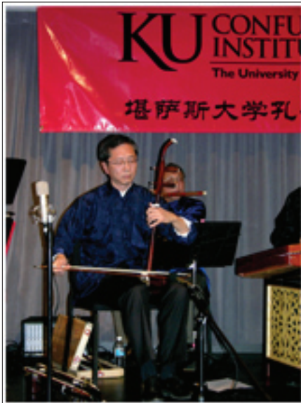
The erhu was just one of the traditional instruments included in a performance of Chinese music by the Kansas City Music Ensemble.