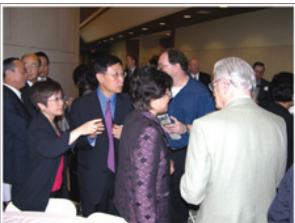
Vice Minister Wu speaks with some of the participants after the unveiling.